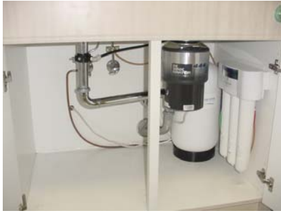
SQC3 Reverse Osmosis System