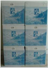
ULTRA Soap Super 5000 (6—13" Sq. Boxes)