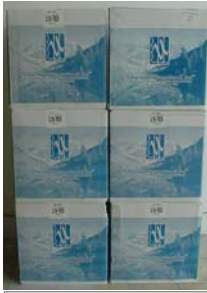
ULTRA Soap Super 5000 (6—13" Sq. Boxes)