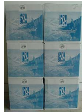
ULTRA Soap Super 5000 (6—13" Sq. Boxes)