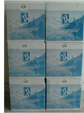
ULTRA Soap Super 5000 (6—13" Sq. Boxes)