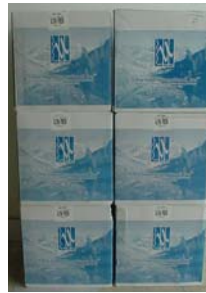
ULTRA Soap Super 5000 (6—13" Sq. Boxes)