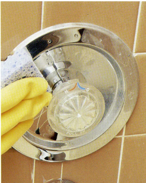
Dirty build-up in shower

AAA BestWater gets rid of the hardness that causes the ugly film and buildup in your bathtub, sink and shower. According to a study conducted by Ohio State University, you can cut house cleaning by 1/3 with the help of soft water. That's over 10 eight-hour workdays per year!