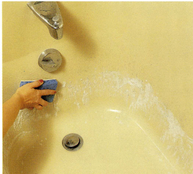
Scum ring around tub

“We don’t have to clean our toilets and bathtub as often as before thus saving a lot of time and effort. They are easier and fast to clean and they look clean. Bye-bye to toilet and bath tub rings.” -Vincente & Felicidad Purificacion, Ewa Beach (Sun Terra on the Park)